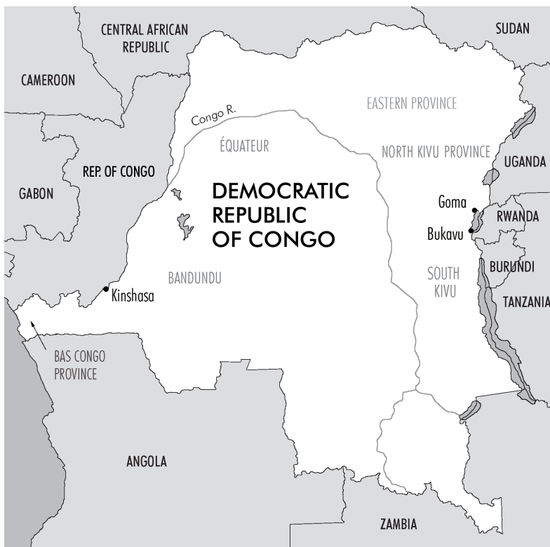
MAP OF DEMOCRATIC REPUBLIC OF CONGO