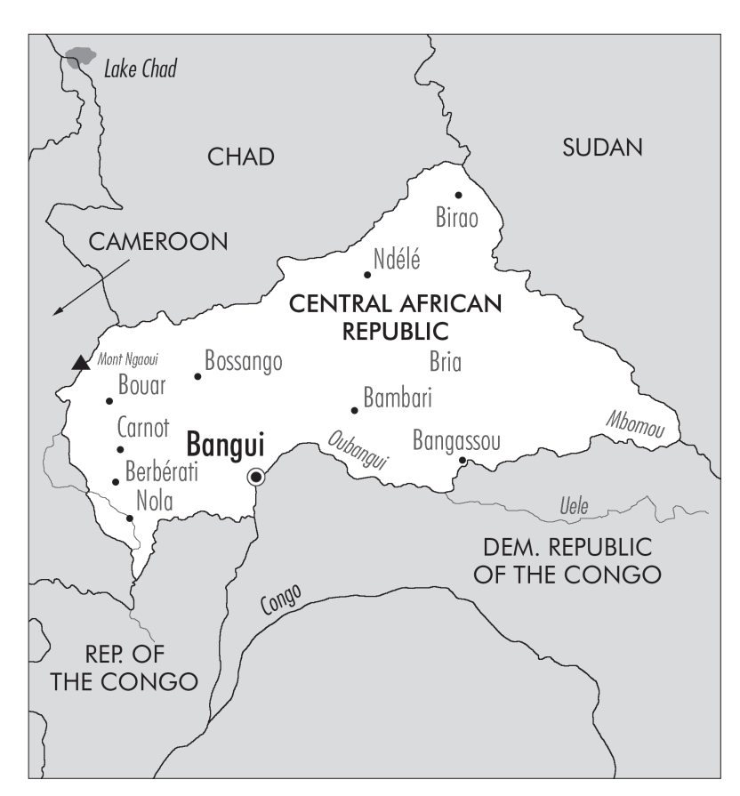
MAP OF CENTRAL AFRICAN REPUBLIC<sup>1</sup>